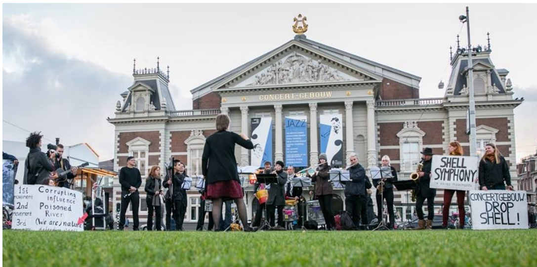
Music action (Oct 5th, 2017) 'Drop Shell sponsorship' Royal Concertgebouw, Amsterdam.

We can shift public support away from the fossil fuel industry by pressuring our public institutions to break the sponsorship ties they have with many fossil fuel companies.